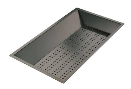
Stainless steel perforated tray PVD Gun Metal 8151 006