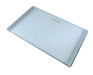
Glass chopping board 8633 300